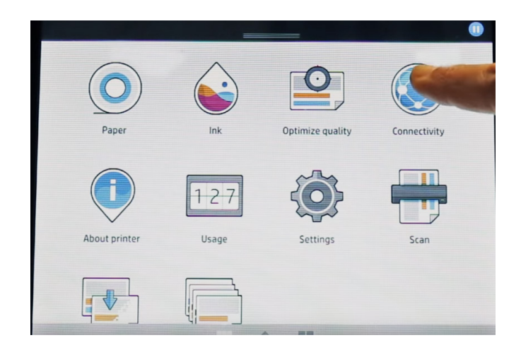
Select the 'Connectivity' icon on the main screen